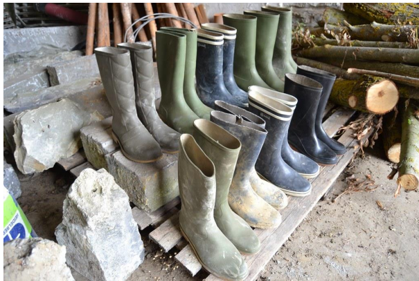
1 - Please remember your wellies!!