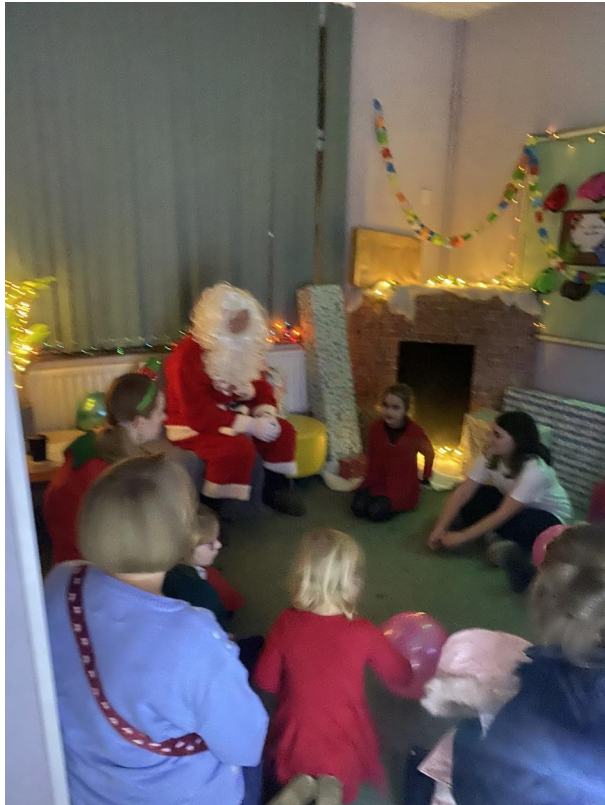
Amazing Christmas productions