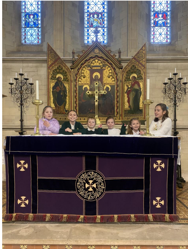
Our Christmas Fair