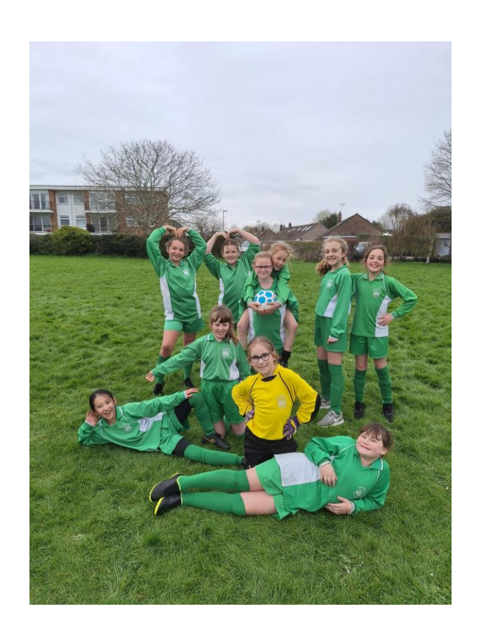
OPAL- Outside Play and Learning