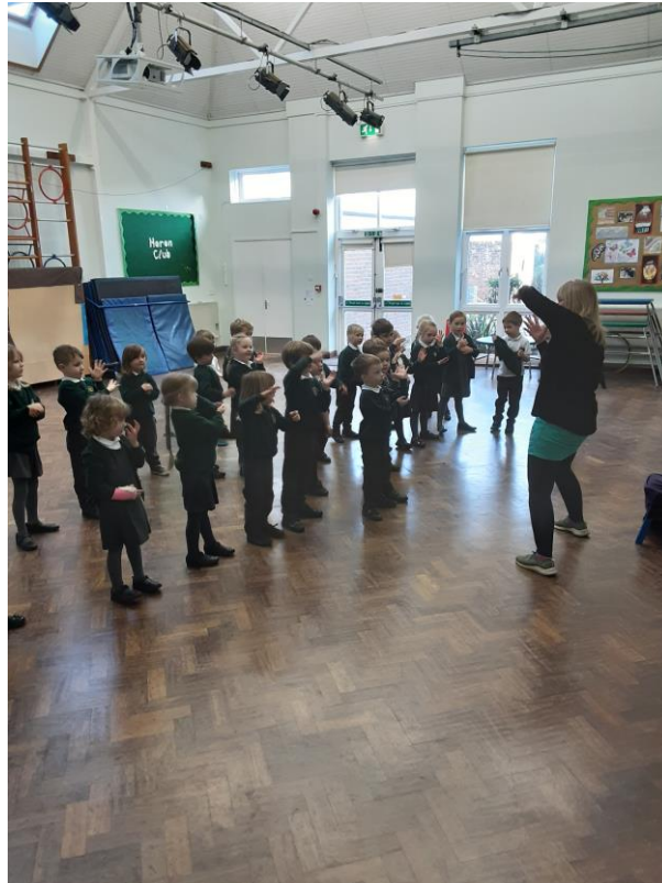
Caterpillar Class assembly