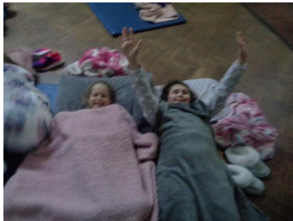
Young Voices at the 02