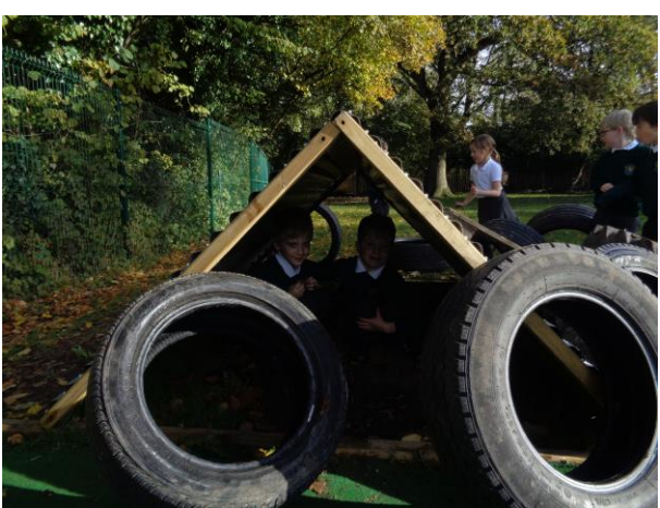
OPAL in Action