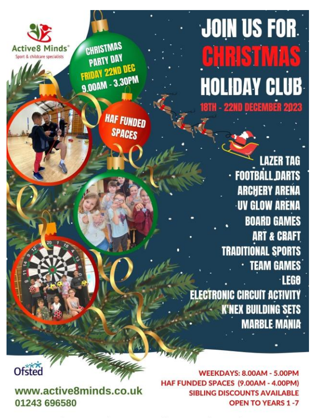
TPS | ST JAMES | SPRINGWOOD | HIGHBURY | MEON | WICOR