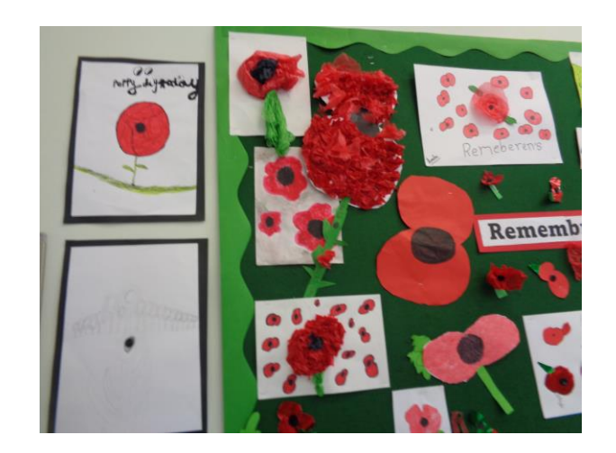
Year 5 Class assembly