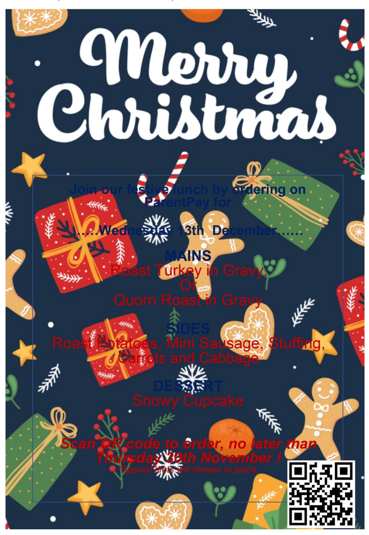
Theme Day - West Sussex - Merry Christmas 13th December