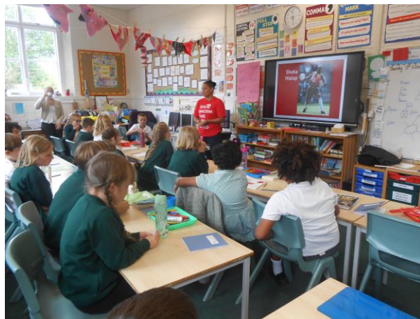
2 - Show Racism the Red Card workshop