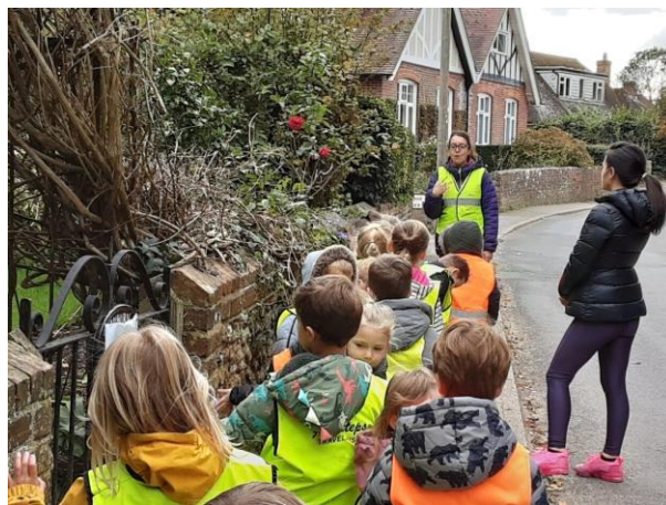
3 - Lady bird Class