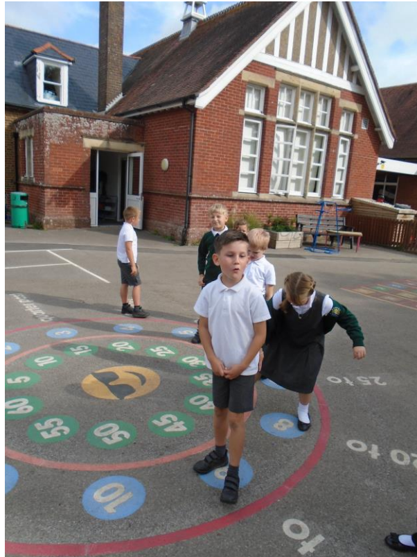
Show Racism the Red Card