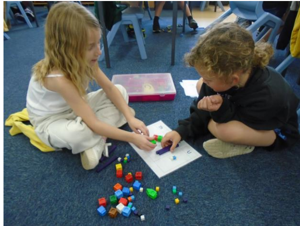
1 - Year 3 Maths