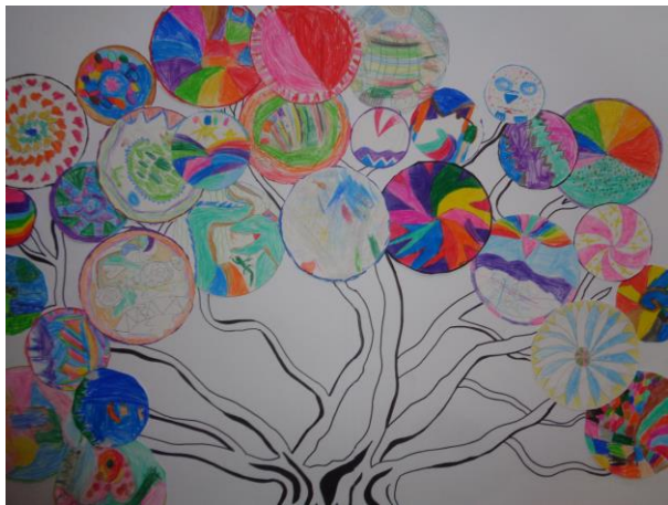
Art club get creative