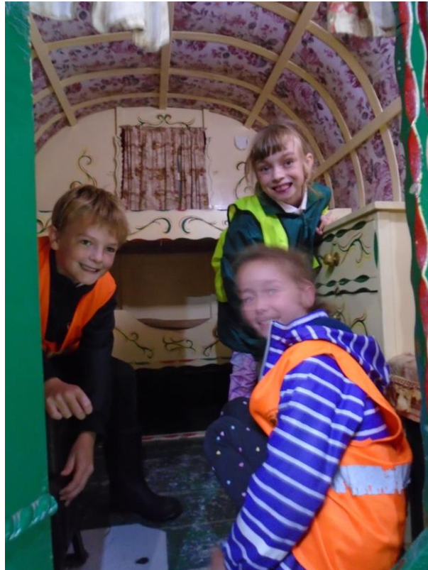
Outdoor learning week