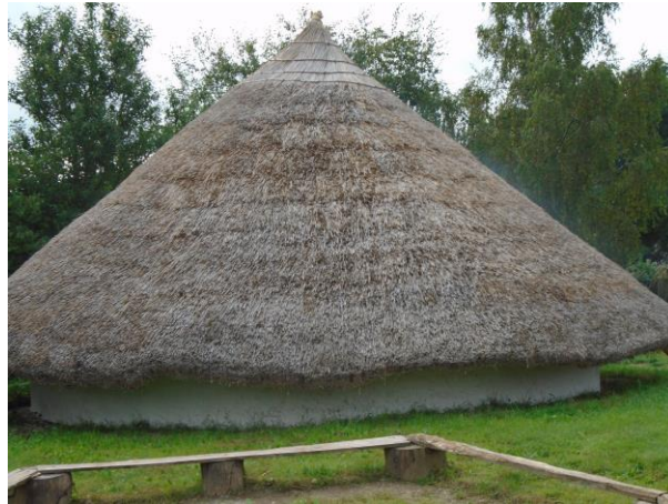
Year 4 explore the Weald and Downland Museum