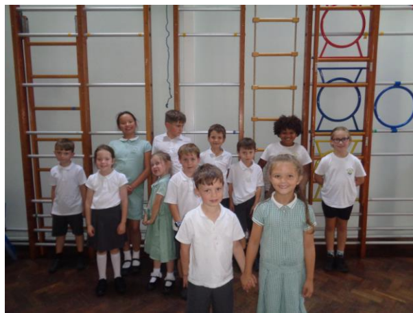
Year 3 head to Butser Ancient Farm