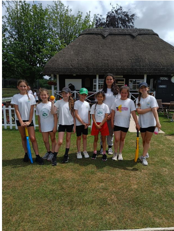
Year 5 Forest School