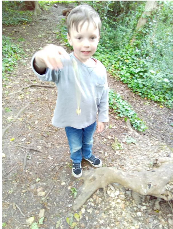
Year 1 go Victorian