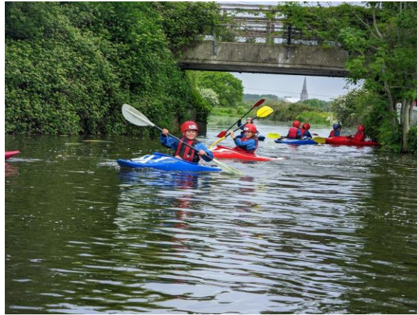
Year 6 residential in Cobnor