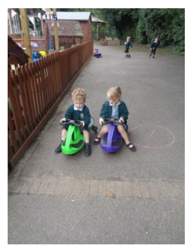
2 - Our new 'fast cars'!