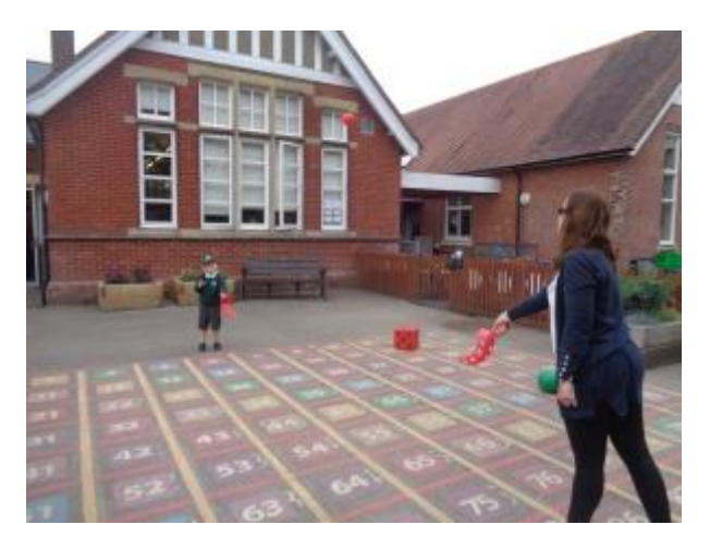
1 - Playing catch